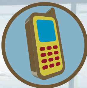
CONTEX Mobile Groups™

All of this automated communication can be backed up by a fully-staffed command center using the CONTEX Summit's industry-standard operations interfaces, giving your customers even greater security and assurance that their communications will be reliable, secure, and easy-to-use.